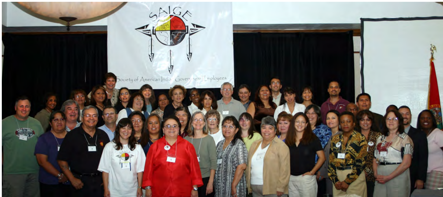
PHOTO: ATTENDEES AT THE FIRST SAIGE NATIONAL TRAINING CONFERENCE IN FT. LAUDERDALE, FL, OCTOBER 2004

For more information on the Origins of SAIGE go to https://saige.org/home/history/