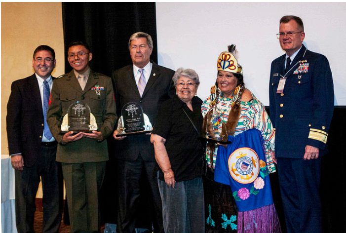
Veterans Track Awardees from 2014 conference.

The Warrior Society performs several duties for SAIGE including: planning and conducting the Veterans/Military portion of the annual training program, acting as a liaison between SAIGE and military and veteran organizations, providing the SAIGE honor guard, and serving as an information and resource network for military/veteran issues.