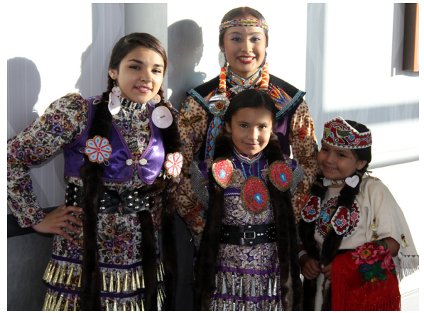
Coeur d' Alene Dance Troupe.

The opportunity to catch up with old friends and meet new ones was priceless. The food was wonderful, and I traveled home with some in my bag feeling very full, blessed, and extremely appreciative of the special attention that the board and the volunteers provided. The attention to small details, the words and the deeds reveal the greater truth; that is the sincerity and power of the SAIGE program. Thank you so much, and be safe out there. I'll plan to see you next year!