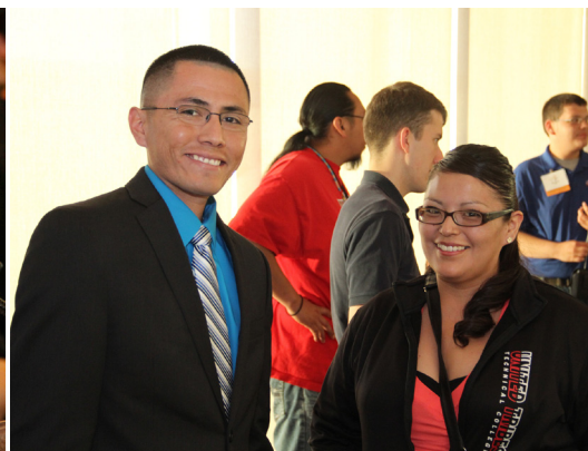
Youth Track speaking and networking at the conference.